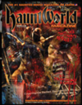
ISSUE # 14