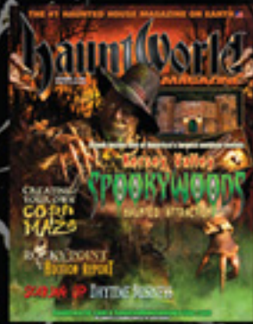
ISSUE # 16