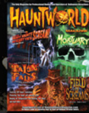
ISSUE # 26