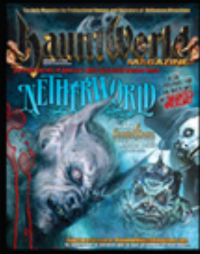
ISSUE # 20