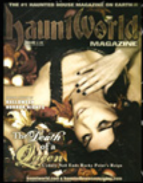
ISSUE # 15