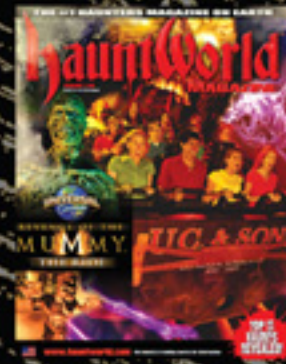
ISSUE # 9