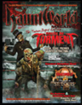
ISSUE # 21