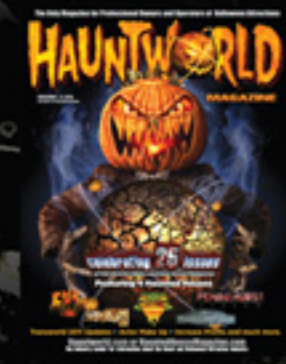
ISSUE # 25