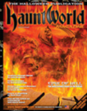
ISSUE # 7/8