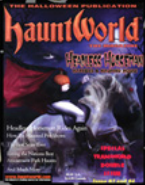
ISSUE # 3/4