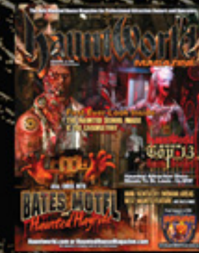
ISSUE # 19