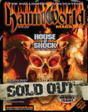
ISSUE # 5/6