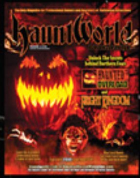
ISSUE # 23