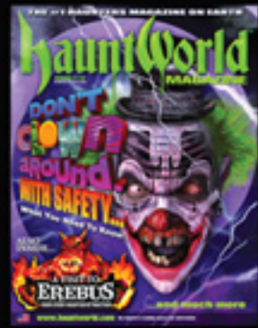
ISSUE # 12