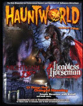
ISSUE # 27