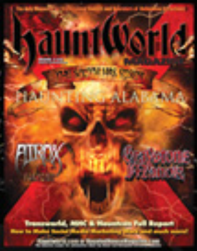
ISSUE # 22