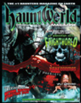
ISSUE # 13