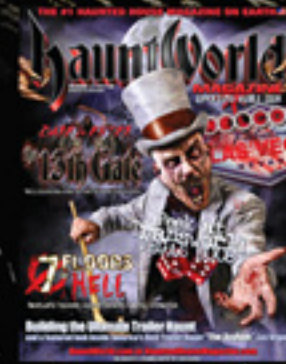
ISSUE # 17/18